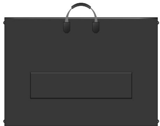
Folded front view 2